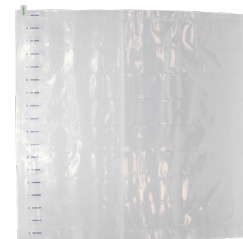
AIR CUSHION SHEET

Heavy-duty, white corrugated box designed for the Hawk enclosure