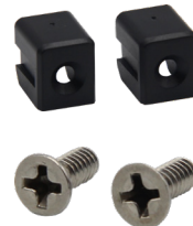
RAIL CAPS & SCREWS

Accommodates a display PCB and one additional PCB, and easily mounts to the Hawk enclosure's built-in rails.